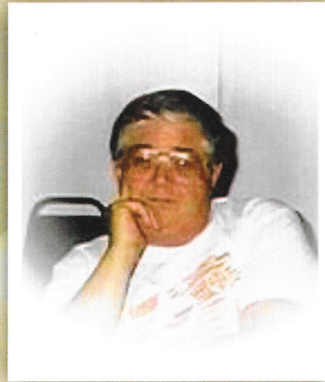
IN LOVING MEMORY