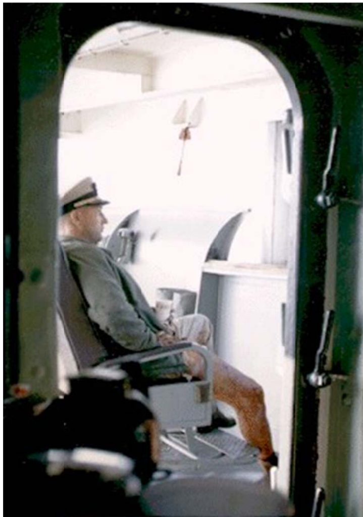
Captain, William Loren McGonagle USS LIBERTY (AGTR-5)