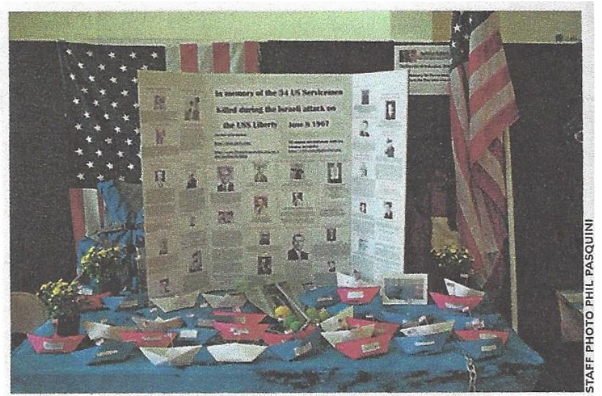
An altar on display at San Rafael, California's Day of the Dead observance honors the 34 servicemen on the USS Liberty killed by Israeli military forces.