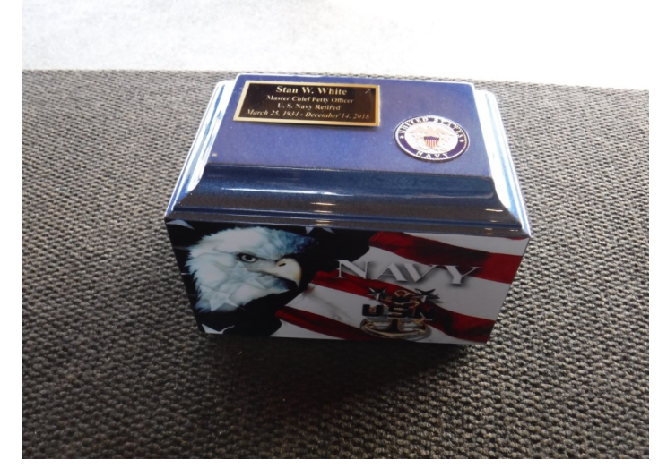
Stan White's urn